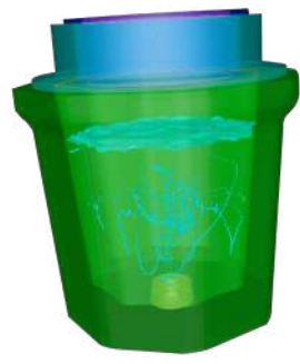
Particle monitoring during ingot filling