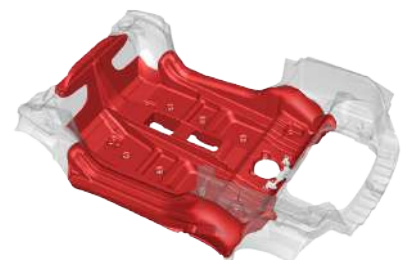
Displaying the expansion phase