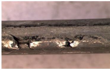
Damage criterion Lemaitre